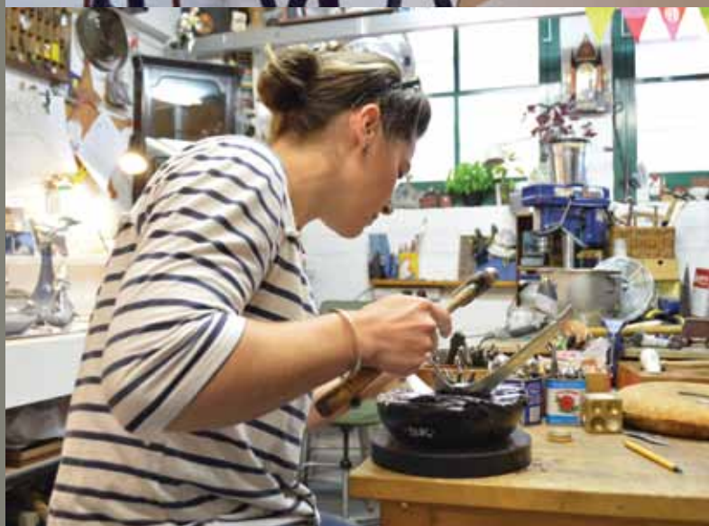
Images from top: Meet Your Maker, Summer Show at White Stuff, Bryony Knox video for SOFA Chicago