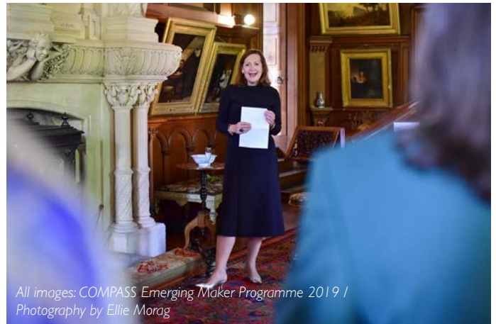
All images: COMPASS Emerging Maker Programme 2019 / Photography by Ellie Morag