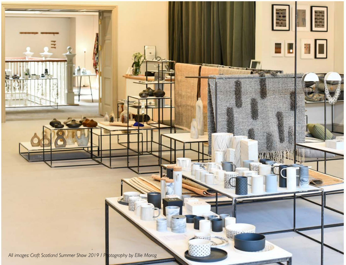
All images: Craft Scotland Summer Show 2019