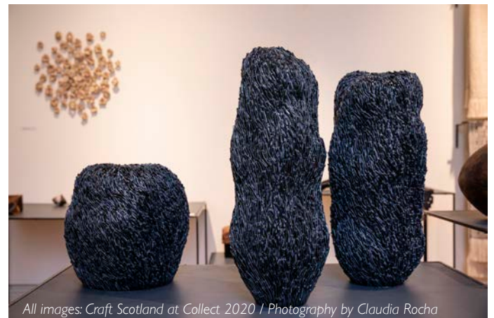
All images: Craft Scotland at Collect 2020

"I really enjoyed taking part in Collect and would love to do so again. It was a great experience and Craft Scotland made it really straightforward, as well as putting together a stand that really stood out."