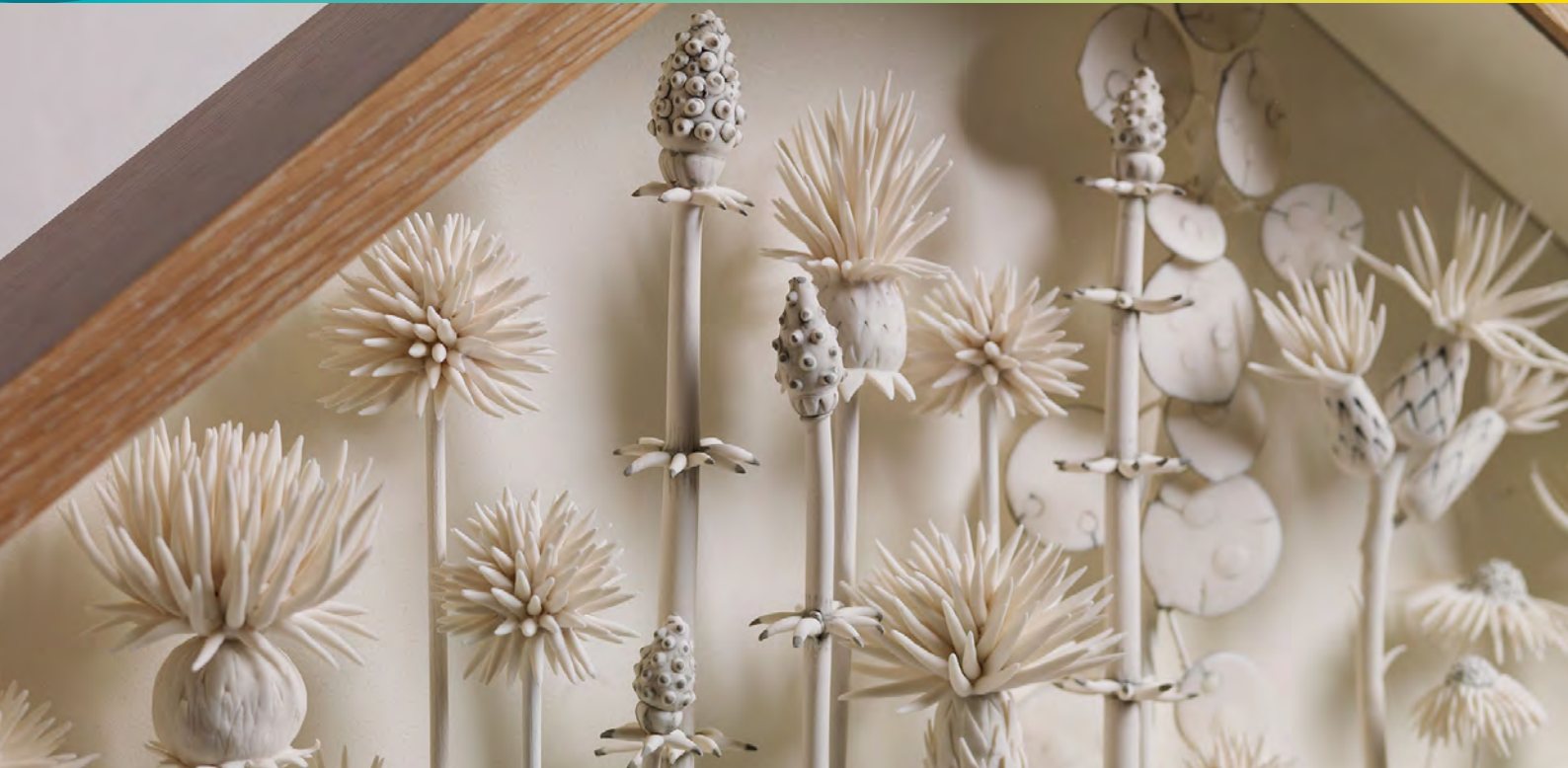
Forth Flora © Lorna Fraser

staff and visitors. My intention was to create a thoughtful piece of work that can provide an opportunity for contemplation but complex enough to continually offer up new discoveries."