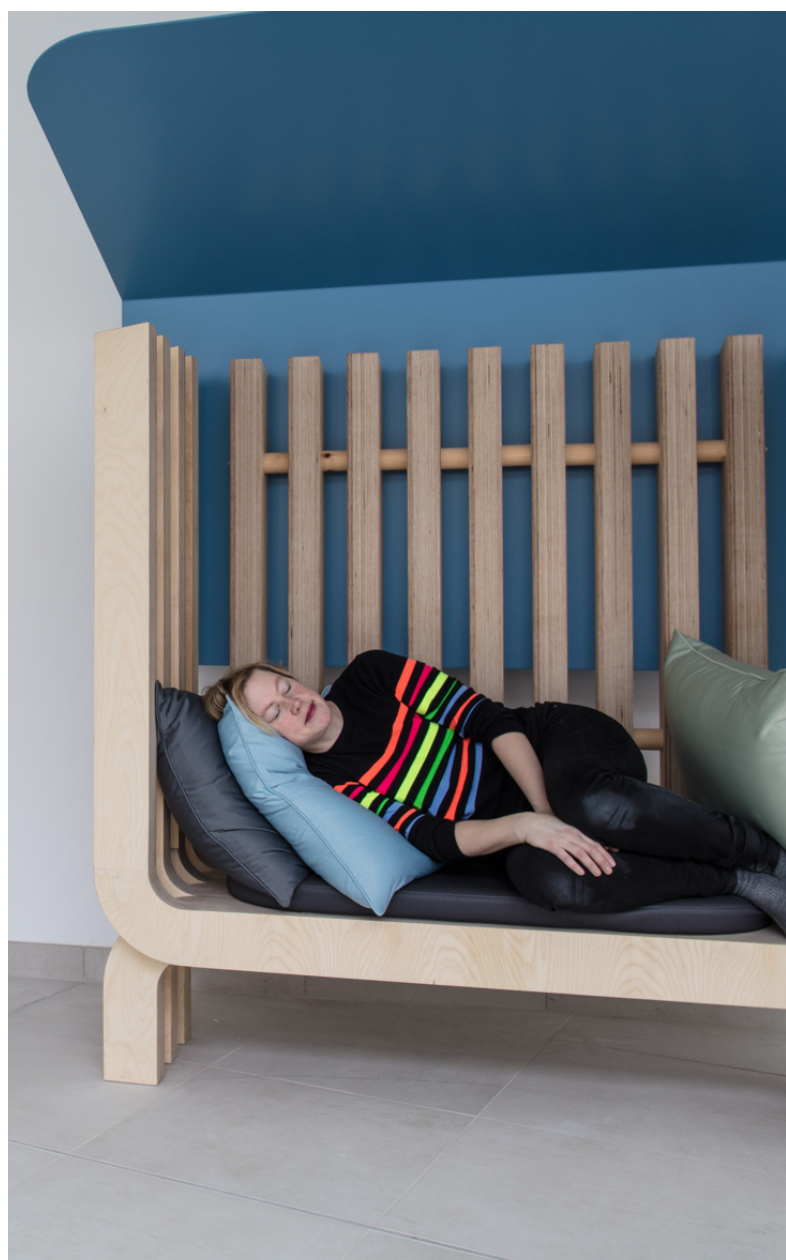
Sanctuary © Lindsay Perth, photo by Rebecca Milling